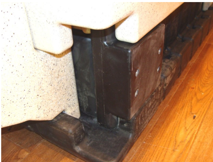
Plastic plate slid into channel on Wave Armor Dock.